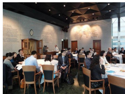
23 member companies attended the EGM.