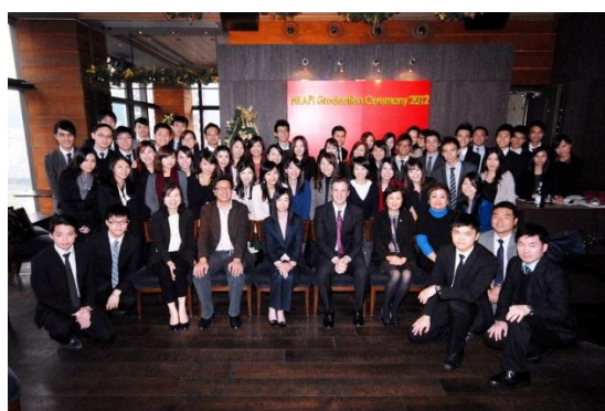
64 medical representatives graduated from this year's Certificate of Medical Representative course.