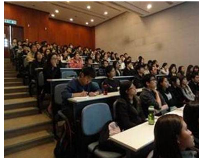
About 100 students from different faculties attended the career talk hosted by the Association.