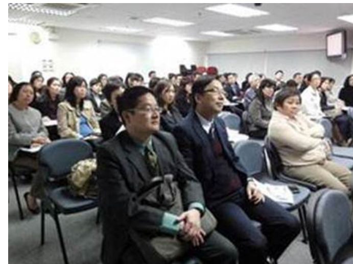
About 60 members attended the all-members meeting.