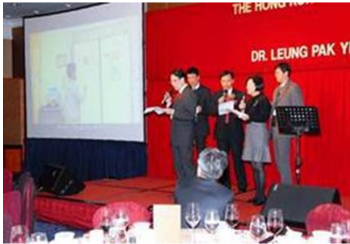
Guests from the Hospital Authority sang the HA 20th Anniversary Theme Song 'The Dawn'.