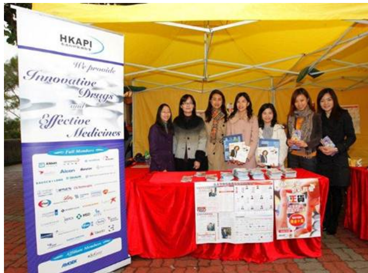
The booth of HKAPI at the Career Fair organized by the Chinese University of HK.

During the presentation, a brief overview of the Association, profile of our member companies, as well as different types of job including clinical research, medical affairs, sales, marketing were discussed and students were introduced to the job nature, requirements on qualification, personal attributes. About 100 students attended the talk which enabled them to have a more in-depth understanding of the pharmaceutical industry.